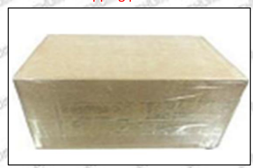
Pic No. 2 Domestic express packaging: Wrapped by Transparent tape

▲ Minors are prohibited from using transparent tape, yellow tape, black wrapping protective film, and white wrapping protective film to avoid personal injury.